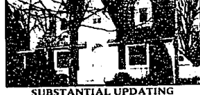
SUBSTANTIAL UPDATING Plenty of room for all in this Northwood Cape Cod! Newer kitchen, central air, two master suites and a home warranty. (S172E) 647-6400 $244,888