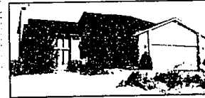
OPEN FLOOR PLAN Super sharp family home features great room with vaulted ceiling and fireplace, neutral interior decor and professionally finished lower level. (A844E) 851-4400 $199,950