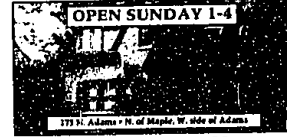
OPEN SUNDAY 1-4 1733 Adams + N. of Maple, W. side of Adams CHARMING TUDOR Within walking distance to downtown Birmingham. Spacious rooms, wood floors, fireplace in living room and double rear screened porches. (A173E) 647-6400 $159,900