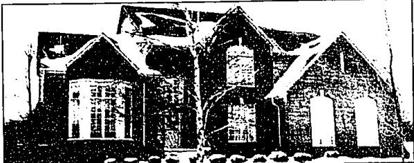
WEST BLOOMFIELD LESS THAN TWO YEARS OLD! "Just like new" Colonial without the time to build! Full two-story multi-windowed family room, gourmet kitchen and twin staircases. Great tree site an excellent subdivision! (OW629E) 641-1600 $369,900