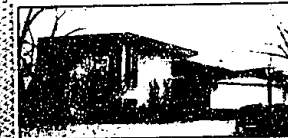
CONTEMPORARY TRI-LEVEL Huge slate foyer sets you into great room. Four large bedrooms, two full and one half baths and a lower level for possible teenager or in-law suite. (W203E) 851-4400 $164,900