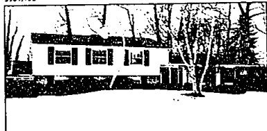
BLOOMFIELD HILLS UPDATED custom built home on corner tree lot offer spacious rooms with lots of closet space and storage. updated kitchen and lake privileges on Upper Long Lake. (L181E) 647-6400 $319,900