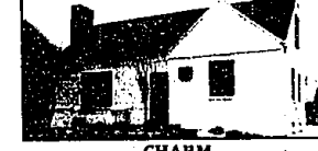
CHARM Brick Bungalow on wonderful street with new landscaping in front, attractive brick walk and new porch. Recently remodeled kitchen. (T100B) 647-6400 $166,000