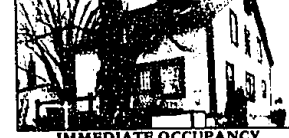
IMMEDIATE OCCUPANCY Two-story home with some Victorian features offers 4 plus bedrooms, two baths, den, basement, 3 car garage and an updated deck. (PS110E) 641-1600 $164,900