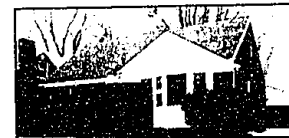
OCCUPANCY AT CLOSE Ready to move into brick and aluminum Bungalow with 3 bedrooms, dining room and a 2 1/2 car detached garage. (R378E) 647-6400 $151,000