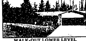
WALK-OUT LOWER LEVEL Totally custom built 3 1/2 bedroom home with 3 levels, but not chopped up. Built better than most, old or new! In-law suite and deck. (N637E) 647-6400 $238,000