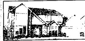
IMMEDIATE POSSESSION Outstanding Colonial features formal dining room with bay window view of woods. Library, family room with fireplace and four bedrooms. (S216E) 851-4400 $259,900