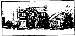
PEACEFUL Great 2.5 acre site with woods and pond! newer brick Colonial with 3 bedrooms, 3 1/2 baths, finished walk-out, deck and 2 car attached side entry garage. (EC833E) 641-1600 $229,800