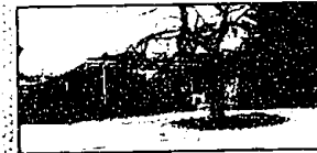
SPACIOUS RANCH Over 2,100 sq. ft. of living space! Living room recently remodeled kitchen. Family room, library with fireplace. (L131E) 647-6400 $199,900