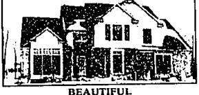
BEAUTIFUL Remington model by Putte with over 2,950 sq. ft., 4 bedrooms, 2 1/2 baths, hardwood floors in foyer and large kitchen, neutral decor and extra high basement. (M187E) 851-4400 $309,900