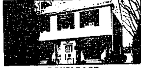
DOUBLE LOT Classic Colonial on beautiful street with center entrance foyer, separate dining room, family room, two car garage and patio. (K173E) 647-6400 $194,900