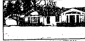
IMMACULATE CONDITION Outstanding Ranch loaded with updates including newer furnace, central air conditioning, driveway and shingles. Home Warranty included! (W645E) 647-6400 $180,000