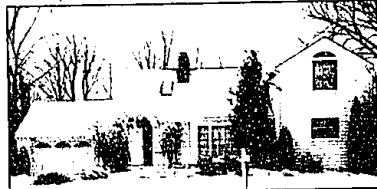
BIRMINGHAM SPECTACULAR renovated Cape Cod on a super private lot! Wonderful dining room with vaulted ceiling and french door to deck. Exciting master suite and bath. Walk to town. (B141E) 647-6400 $149,900