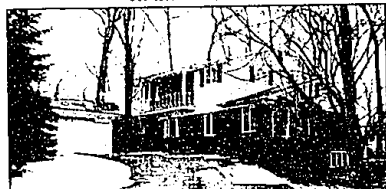
BLOOMFIELD HILLS PRESTIGIOUS 1.5 ACRE! Wealth and class are united in this Victorian Colonial! Four five bedrooms, three full and one half bath, Florida room, jacuzzi and a finished lower level walk-out. (L126E) 851-4400 $299,000