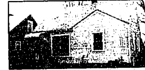
"DOLL HOUSE" Move right in to this totally updated Bungalow with new bath, kitchen, super upstairs master bedroom with walk-in closet and a 3 1/2 car garage. (P873E) 647-6400 $99,900