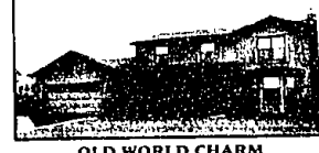
OLD WORLD CHARM Large and cozy great room with natural fireplace and bay window, dining room connecting to dynamic kitchen and many fabulous extras! (S846E) 851-4400 $174,900