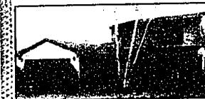
IMMEDIATE POSSESSION Nice 3 bedrooms, 1 1/2 bath Colonial in newer subdivision includes all appliances, deck and attached 3 car garage. Priced under market value for fast sale! (M118E) 851-4400 $199,900