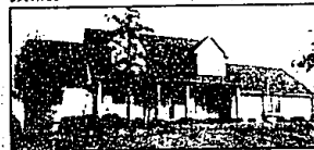
SERENITY & BEAUTY Country side living in this 1991 custom built Cape Cod that backs to open farmland. Home offers 4 bedrooms, 3 1/2 baths and is minutes to downtown Rochester. (O940E) 641-1600 $313,900