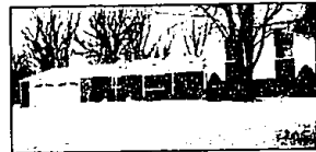
WOODED 1/2 ACRE Delightful 3 bedroom, 2 1/2 bath 5 1/2-level with updated kitchen, hardwood floors, oak cabinets, newer windows. Bay overlooks charming garden. (F6921E) 641-1600 $174,900