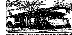
CUSTOM BUILT Not enough room to describe all of the great features of this Royal Oak home. Special kitchen, large family room and three-season florida room. Over 1900 sq. ft. of living space. $186,000 (02MAG) 810-280-4777