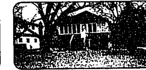
WALLED LAKE Lakesfront Paradise - waterfront fenced raised ranch 4 bedroom beach house in serene seclusion. Aluminum / brick, with sensational views, single owner. Space for expansion, private drive. Open floor plan, 2 fireplaces, huge living room - must see. (613WAL) 810-349-6800