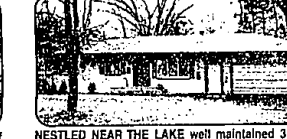
NESTLED NEAR THE LAKE well maintained 3 bedroom ranch has "open" feeling & neutral decor. Remodeled kitchen & bath. Partially finished basement, private wooded area with lake privileges in Clarkston. $143,900 (OE45CEN) 299-6200