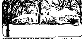
DRIVE THE GOLF CART HOME! Elegant 5 bedroom, 4 full & 3 half baths home overlooks the golf course. Beautiful views. In-Law Suite, Family Room with wet bar. Formal Living & Dining Rooms. $425,000 (COB30FA) 626-8000.