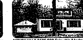
AUBURN HILLS CAPE COD Enjoy this 3 bedroom, 1.5 bath home on a great tree lot. Entertainment in the finished basement. Avondale school. $124,900 (OE210AK) 299-6200