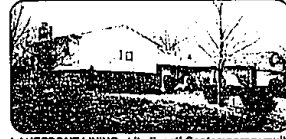
LAKEFRONT LIVING at its finest! Contemporary multi-level, 4 bedrooms, 3.5 baths. Cathedral ceilings, oak floors, custom kitchen with Jennair. 2 wet bars, 2 car garage. Sandy beach & boat dock. $279,000 (COB30ARA) 626-8000