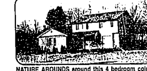
NATURE ABOUNDS around this 4 bedroom colonial with a finished basement, neutral decor and many amenities. Kick up your feet, light up the fireplace and get cozy in the beautiful family room. Call now for an appointment. $183,500 (OE20EPA) 299-6200