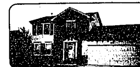
OWNER TRANSFERRED! Fabulous 3 Colonial with spacious eat-in kitchen, dining room, family room. Finished basement, 1st floor laundry, attached 2 car garage. Lots of storage space. Beautiful landscaping. Reduced! $129,900. (COB27FRAN) 626-8000.