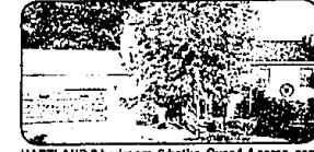
HARTLAND 3 bedroom, 2 baths. Over 1.4 acres, central air, Vacuum, rec. room with built-in bar in oak, remodeled main bath, 3 tier dock, 5 ceiling fans, stove, refrigerator, dishwasher. Also above ground pool, 1 year home warranty. (270MIC) 810-349-6800