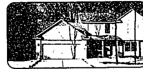
PRIDE OF OWNERSHIP Looks brand new, custom window treatments, neutral decor. Professional landscaping, sprinkler system, 1st floor laundry. Spacious 3 bedroom, 2.5 bath Colonial with central air has it all! $196,900. (OCB75WOO) 626-8000.