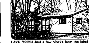
LAKE ORION Just a few blocks from the lake! Move right into this freshly decorated 3 bedroom ranch with a large fenced corner lot, 2 deck, 2.5 heated garage, priced to please. $115,900 (OE610AK) 299-6200