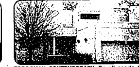
TOBOCHAN CONTEMPORARY. On all sports Otter Lake with private dock and sea wall. Custom deck with built-in hot tub. All rooms have wonderful lake view. 4 bedrooms, 2.5 baths. $489,900 (598EV) 810-280-4777