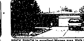
BRICK RANCH in excellent Warren area. Walk to elementary school, 3 bedroom, 2 bath, almost 1700 sq. ft. of living area on main floor plus an additional 1200 in finished basement with fireplace & wet bar. Very large fenced yard. $134,900 (OE277DOW) 299-6200