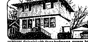
INTOWN Colonial with three bedrooms, garage, basement. Lots of windows, hardwood, french doors to family room. $109,000 (17FLO) 810-280-4777