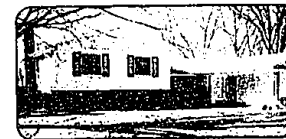
THE KEY TO HAPPINESS Wonderful 3 bedroom, 2.5 bath ranch. Large living room, dining room opens to Florida room. Finished lower level has family room & fireplace, 1st floor laundry, garage. $160,000. (COB335TO) 626-8000