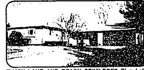
ENJOY LAKE AND BEACH PRIVILEGES Pine Lake Estates 3 bedroom, 2.5 bath ranch. Family room with fireplace, 1st floor laundry. Many updates, basement, garage. Bloomfield Hills schools. $199,900. (COB60ALA) 626-8000.