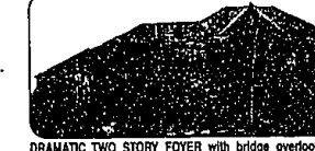
DRAMATIC TWO STORY FOYER with bridge overlooking great room with fireplace. 4 bedroom, 3.5 bath custom built home with many upgrades. Formal dining room, built in desk and walk-in pantry. Media room and library. Call for more information. $395,000 (OE58RID) Holly Hohnholt 299-6200