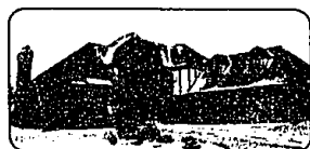
PANORAMIC VIEWS Dramatic waterfront living! Walls of glass, oak staircase, custom island kitchen, great room, bonus room with skylight. Master has garden tub, 3+ garage, 3 boat holts. $539,750. (COB11AT) 626-8000

Corporate Relocation Services 1-800-221-2060 Century 21 East Inc. 34203 Van Dyke Sterling Heights 313-979-1600 Century 21 East Inc. 25813 Jefferson St. Clair Shores 313-778-0100 Century 21 East Inc. 1460001 Hall Road Warren 313-778-0100 Century 21 East Inc. Universal Mall Plaza Warren 313-778-0100 MLS EACH OFFICE INDEPENDENTLY OWNED AND OPERATED