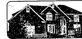
QUALITY THROUGHOUT in popular Hawthorn Hills Sub. 4 bedrooms, 3.5 bath. Priced at $449,000 (OE37MER) Holly Hohnholt 299-6200