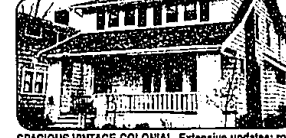
SPACIOUS VINTAGE COLONIAL. Extensive updates: roof to boards, 1995; lav, remodeled. Kitchen updated. Fireplace screen matches stained glass work. Master bedroom with huge walk-in closet. Attic bonus room, family room, huge dining room. $184,900 (17WOO) 280-4777