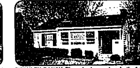
BERKLEY RANCH. Three bedroom, two bath, 1.5 car garage on large lot. A must see! $99,000 (24CAT) 810-280-4777