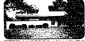
BEST BUY in desirable Walled Lake, maintenance free, 3 bedroom, 2 bath ranch on huge private fenced lot. Newer furnace, windows, kitchen, garage with direct access, doorwell to patio off kitchen, cul-de-sac location. City water & sewer. Close to x-ways & 12 Oaks mall. (115ASH) 810-349-6800