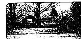
MOVE RIGHT IN! This wonderful 3 bedroom hi-level is in move in condition. Featuring family room with fireplace, newer carpeting, attached garage. Hurry! This one will not last. Asking $115,900. (COB44CRO) 626-8000.