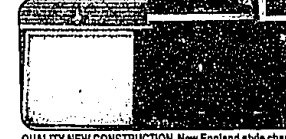
QUALITY NEW CONSTRUCTION. New England style charming row townhouses. Attached garage, private entrance, lower level - library/office w/patio. 2nd level - open floor plan, living room with doorwell to balcony. 2 generous bedrooms with cathedral ceilings. $99,900 (85LJH) 280-4777