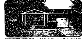
FARMINGTON HILLS Move right into this open floor plan home and enjoy. Completely remodeled April 95! White kitchen, new bath, new carpet, 3 bedrooms, 2 car attached garage, newer roof, windows, paint, water heater, electric, list goes on. Deck & pool. Large lot. Must see. (21100) 810-349-6800