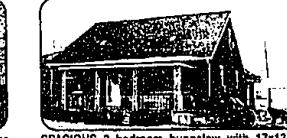
SPACIOUS 3 bedroom bungalow with 17x13 lower level and garage. Home warranty. Updated kit & bath, furnace, roof, windows, hot water heater, sharp decor. $62,500 (OE11REP) 299-6200