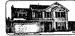
SOUTH LYON Seller transferred - 9 month "new home", no new home hassle, no waiting for builder, landscaping & sprinklers already installed. 4 bedroom, 2 1/2 bath, 2 car attached garage, family room, fireplace, central air, just move in. (9630AK) 810-349-6800