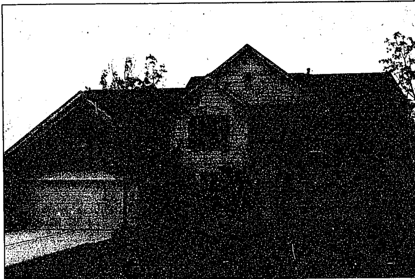
Remington Model: This house, which features four bedrooms and two staircases, is the most popular among the offerings at Marina Pointe.

There are five floor plans available. All have been nearly equal in popularity, Mensel said, with the Remington selling just slight-