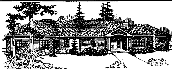
The Vera: A wide lot is needed for this long layout with its separate living zones.