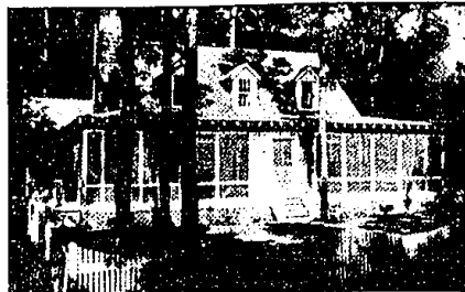
Screened porch: This outdoor living room provides cool, summer living without the distraction of bugs.

RDS receivers, the company says, could be seen as the next step in the evolution of audio systems in vehicles, from entertainment systems to information systems.