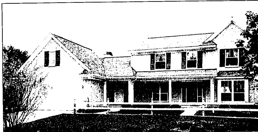
In demand: This Birchwood model at Birchwood Park, with four bedrooms, 2-1/2 baths and plenty of elbow room, is especially popular.

"The school is a real big selling point, the sidewalk is a selling point," she said. "Who the builder is a big selling point."