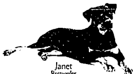
Janet Spitzweil 2 1/2 years old