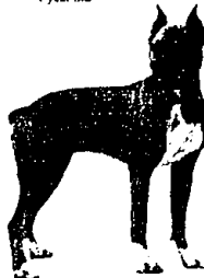
Spike Boxer 2 years old