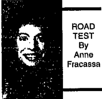
ROAD TEST By Anne Fracassa

block, a cast-aluminum oil pan, long-life coolant, low-distance spark-plug wires, platinum-tipped spark plugs and a new starter motor that's smaller, lighter and more durable.