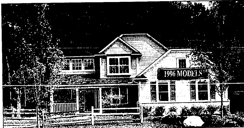
Muirfield plan: This model at Palmer Lake Estates features a dining room, living room and great room on the main floor, four bedrooms upstairs.

Base price is $234,000. The Canterbury has the same basic layout except the kitchen has a large island and the master has two walk-in closets.