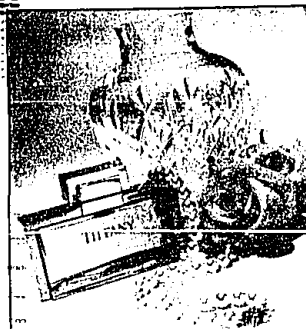
Tiffany tastes: Traditional gifts for Mom might include a pearl necklace, crystal vase, and fragrance.