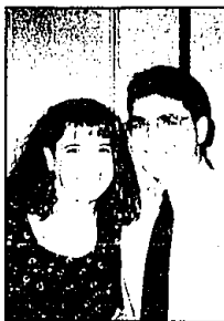
The couple are planning a June wedding in Woodside, Calif.

Her fiancé is a graduate of Marist High School in Chicago and the Massachusetts Institute of Technology. He is employed for Books That Work in Palo Alto, Calif., as director of product marketing.