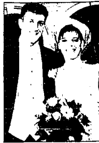
The couple are planning a June wedding in Woodside, Calif.

A reception was held at the Cohurn Hotel in Boulder. The newlyweds honeymooned on Aruba, and they are making their home in Denver.