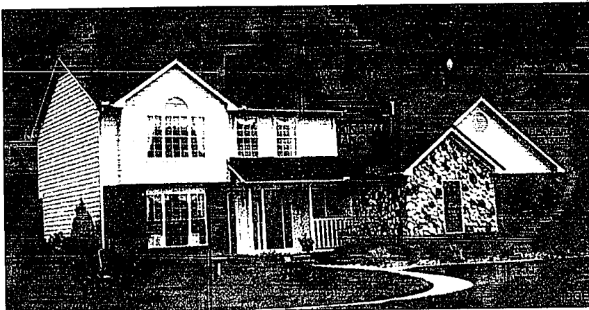
Manchester Model: This colonial at Fox Chase has a living room, dining room and family room on the main floor and a choice of three or four bedrooms upstairs.

The Manchester under construction will have both.