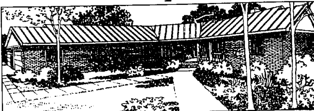
The Lida: This rambling ranch is notable for its separate private areas and open shared areas.

Rectangular wings extend from two sides of the central living area. This arrangement allows for kids and teens to make as much noise as they want in their bedrooms, without