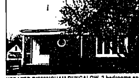
UPDATED BIRMINGHAM BUNGALOW. 3 bedrooms and 2 baths. Large open rooms, oversized master suite with full bath, walk-in closet and library. Fireplace in living room, hardwood floors. An absolute pleasure to show. $199,900 (644-6300) 625230 21465