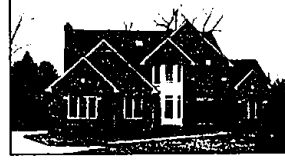
CAMBRIDGE BUILT 3,350 sq. ft. colonial, 2-story foyer, 9 ft. ceiling on 1st floor, custom milled base and case molding, radius staircase, custom kitchen with island, luxurious master suite with whirlpool tub and shower, 3 car side entrance garage. (851-5500)