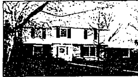
HIGH QUALITY BLOOMFIELD VILLAGE COLONIAL on deep well landscaped lot. 4 bedrooms. Fieldstone front, gracious foyer, newer kitchen, library and family room with built-in bookcases, some hardwood floors, porch. (644-6300) 624844 21460