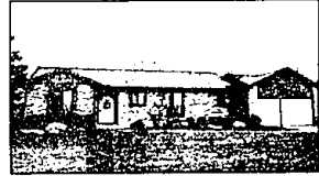
SPACIOUS RANCH with three large bedrooms, master bath, huge great room with fireplace and vaulted ceiling, first floor laundry, all appliances stay, close to 696 and 12 Oaks Mall. Walled Lake School District. $169,900 (851-5500)