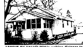
ACCENT ON VALUE! Within walking distance to 3 parks from this in-town neighborhood. Enclosed front porch, rear patio after a hectic day. 2 bedroom home, fresh paint, new carpet & new kitchen cabinets and countertop. $105,900 (651-3500) 624789 21455