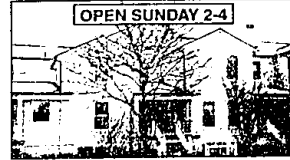
OPEN SUNDAY 2-4 EXQUISITE DETAIL AVAILABLE in downtown Birmingham newly constructed townhome. 2-3 bedrooms, family room, wonderful master suite. Expansive use of glass, skylights. 335 W. Brown, S. of Brown, W. of Woodward. (644-6300) 562801 21212