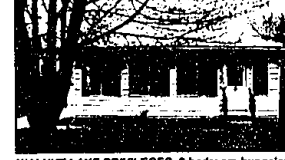
WALNUT LAKE PRIVILEGES. 2 bedroom bungalow. Great opportunity to fix up and live in neighborhood of more expensive homes. Birmingham school district. Front porch, rear deck, basement. $82,900 (644-6300) 625228 21203