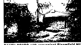
RANCH CONDO with convenient Bloomfield Hills location. Open floor plan features generous room dimensions and beautiful views of pond. 2 bedrooms, 1st floor laundry, full basement. Attached garage. Swimming pool. $149,900 (644-6300) 624816 21461