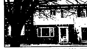
EXTREMELY NICE SECOND FLOOR UNIT, overlooking pool. Bloomfield Hills Schools. Two bedrooms, two baths. Master bedroom with built-in bookcase and entertainment center, central air, carpet. $68,000 (644-6300) 604968 21267