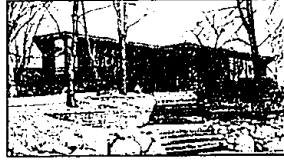
DELIGHTFUL contemporary on private wooded lot of approx. 1/2 acres. Beautifully landscaped with a patio. Featuring 4 bedrooms, family room with fireplace, balcony access from 2 bedrooms, 2 air conditioners, 2 furnaces. $311,000 (651-3500) 623798 21452