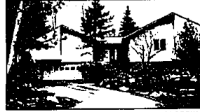
OVER 400' OF BEAUTIFUL AND PEACEFUL LAKEFRONT PROPERTY. Expanded and updated gorgeous three bedroom ranch home. Family room, finished lower level walk-out. Double lot and exquisitely landscaped. $379,000 (644-6300) 624661 21462