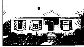
EXTENSIVELY RENOVATED 3 bedroom ranch. Master bedroom with walk-in closet, partially finished basement with shower and toilet. Hardwood floors. Newer kitchen, front porch. Walk to Pierce Elementary. $134,900 (644-6300) 603633 21256