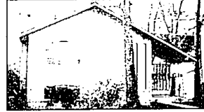
SYLVAN LAKE VIEW. Contemporary Bi-level chalet with 3 bedrooms. New shingles, carpet, wood floors and central air. In-house stereo, many closets and fenced yard. 1/2 block from beach with full privileges. $214,900 (644-6300) 616498 21285