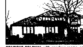
GRACIOUS COLONIAL with spacious rooms, open floor plan. 4 bedrooms, family room, library. 13 ft. cedar walk-in closet in lower level. Domed hot tub on 20x27 ft. deck. Beautifully landscaped oversized lot. $248,000 (644-6300) 21468