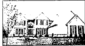
HANDSOME MJC BUILT "ADDISON" MODEL only 18 months old. 2-story foyer and family room. Library, recessed lighting, crown moldings, vaulted ceiling in master bedroom. Sprinkler and security systems. 3 car garage. $298,000 (644-6300) 625220 21479