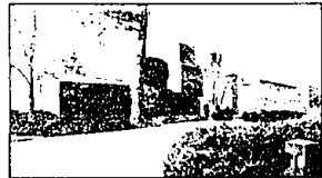
ISLAND LAKE CONTEMPORARY designed for 21st century living. Quality construction, flexible floor plan. Scenic, serene setting. Bloomfield Hills Schools. Call for private showing. (644-6300) 512834 21209