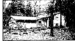
UP NORTH FEELING for this fabulous lake front contemporary. Lake and wood views from many rooms, vaulted ceilings, skylights make home open and bright. Tiered deck, hot tub, gazebo. Close to conveniences, golf course. $269,900 (851-5500)