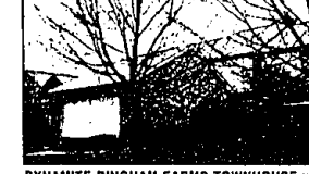
DYNAMITE BINGHAM FARMS TOWNHOUSE well located in quiet complex. 3 bedrooms. Classy appointments: hardwood flooring, plantation shutters, kitchen with island. California closets in master bedroom. $289,900 (644-6300) 625348 21350