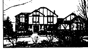
BRIGHT FAMILY TUDOR on one of the nicest lots in Bloomfield Crossings. 4 bedrooms. Bleached flooring in the entry, kitchen and huge family room. Library, lower level walk-out with exercise room. Many nice extras. (644-6300) 616066 21272