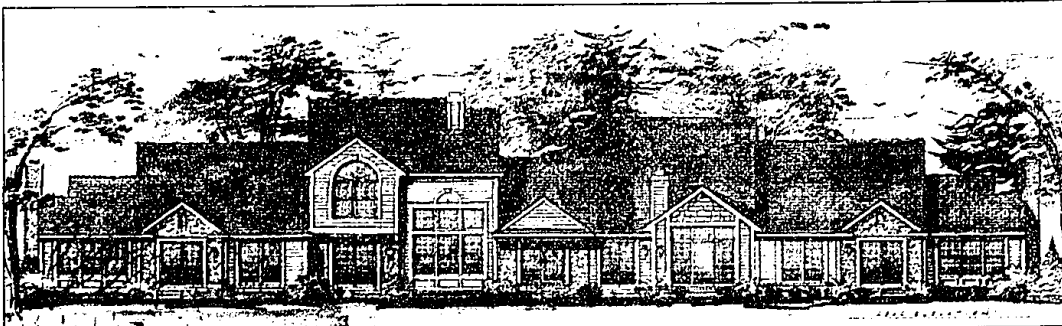
On the links: The rear elevation of condominiums at the Links of Pheasant Run features vinyl siding, brick and plenty of glass.

"I give you the Summit on the Park (recreation center), I give you the public library, I give you