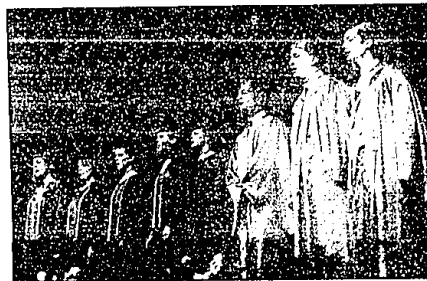
No Goodbyes: The senior choir sings "No Goodbyes" for Clarenceville High's graduation ceremony.