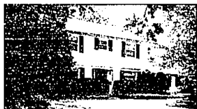
BLOOMFIELD VILLAGE CLASSIC COLONIAL. Center entrance with nice room dimensions. Library with built-ins. Master bedroom with walk-in closet. Walk-up attic. Two fireplaces. Terrific location with great potential. $359,000 (644-6300) 639748 CA 2601