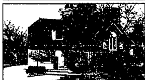
WHAT A FABULOUS HOUSE! A very high-tech two bedroom Tudor. Extensive use of marble and granite, doors with etched glass, kitchen. Music room, master bedroom with cathedral ceiling. Professional landscaped. $419,900 (644-6300) 627283 CA 2592