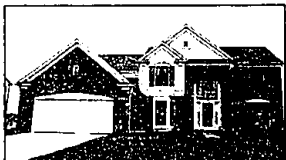
WATERFRONT PROPERTY in PRESTIGIOUS MARINA POINTE between Lake Orion and Indianwood Country Club. Water views from most of the rooms. 2-way fireplace between family room and library, walk-up lower level. $379,000 (644-6300) 557570 CA 2167