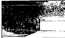
CHARM AND WARMTH in TROY. Four bedrooms, open floor plan, bonus room in basement with walk-in closet. Quality updates include windows, central air and kitchen. Private wooded rear yard. Three parks in sub. $169,900 (644-6300) 638204 CA 2603