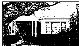
VERY SPECIAL THREE BEDROOM RANCH in BIRMINGHAM. Updated kitchen, central air, hardwood floors. Basement with glass block windows. Fenced yard and garage. A beautiful home on a tree-lined street. $159,900 (644-6300) 638052 CA 2603