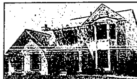
WORTH WAITING FOR! 4 bedroom colonial offers natural oak cabinets, California closet organizers, garden tub, kitchen island, cedar deck with custom rail. Enjoy sidewalks, bike path, nature preserve with pond! $219,900 (651-3500) 635795