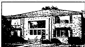
APPEALING CLUB CONDO in Bloomfield. Two bedrooms and two baths. Recent updates include carpet, paint, kitchen floor and alarm system. Locked storage and laundry area in basement. Clubhouse and pool. $69,900 (644-6300) 637701 CA 2502