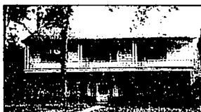
QUALITY LORIMER BUILT HOME in popular Poppleton Park. 4 bedrooms, master bedroom suite with vaulted ceiling. Oak kitchen, family room, beveled glass doors in living room and library and large deck. $369,500 (644-6300) 629673 CA 2511