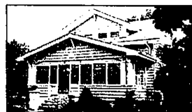
BEAUTIFULLY RENOVATED HOME. On a treed lined street. Many updates in '96. Refinished hardwood floors and neutral carpet. Heated enclosed front porch, 3 car garage. Beautiful French doors in dining room. Don't wait! $174,900 (851-5500) 63718