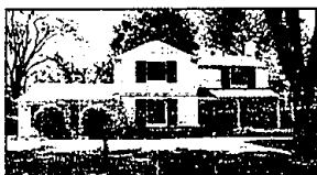
WONDERFUL HOME, QUARTON LAKE ESTATES GREAT LOCATION! Charming four bedroom colonial, recently refurbished and ready to enjoy. Many hardwood floors, marble foyer, newer kitchen with breakfast room and deck. $489,900 (644-6300) 627521 CA 2193