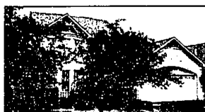
THREE BEDROOM FREE STANDING CONDO. Open circular staircase. Custom mantel on fireplace. Bay windows in dining room and master suite. Beautifully finished without lower level. "New Orleans" front patio. $247,500 (644-6300) 638053 CA 2607