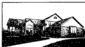
WONDERFUL ROCHESTER HILLS SOFT CONTEMPORARY, CUSTOM BUILT. Unique master suite with 2 walk-in closets, fireplace and large bath with whirlpool tub. Great deck with southern exposure. Home has great flow. $315,000 (644-6300) 625350 CA 6201