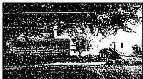
FOXCRIFT OPEN, AIRY AND CHARM. Three bedrooms, three baths, updated white kitchen with built-in granite table. Library, dramatic living room with high ceiling, some hardwood floors. Fabulous setting. $259,000 (644-6300) 629932 CA 2514