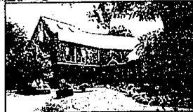
DRAMATIC 3-STORY ARCHITECTURE in Orchard Lake. Foyer opens to living room with cathedral ceiling. Gourmet kitchen with walk-in pantry, 1st floor master with two dressing suites, 6 fireplaces. Theater and studio. (644-6300) 638655 CA 2604