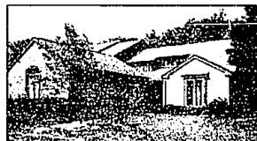
BINGHAM WOOD END UNIT CONDO with wooded ravine setting. 3 bedrooms. Hardwood floors in kitchen and library. Lower level family room. Access to deck from master bedroom, living and dining rooms. $349,900 (644-6300) 617257 CA 2611