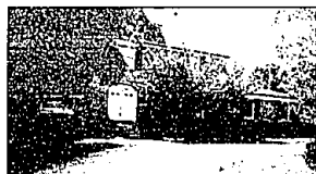
SHARP HOME! Flowing floor plan, spacious rooms, large private deck. Circular drive, mature landscaping. Florida room 13x18. Many extras, light, basically neutral decor. 5 bedrooms, 3 bathrooms, 2 car garage. $289,000 (651-5500)