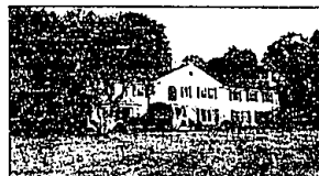
MAGNIFICENT CITY OF BLOOMFIELD HILLS HILLTOP SETTING! Extensive redo in 1995. 5 bedrooms, 4 1/2 baths, hardwood floors, triple crown moldings, Grabb black walnut cabinets, white corian, granite island kitchen. (644-6300) 629420 CA 2610