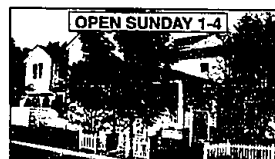
WONDERFUL NEW CONSTRUCTION , end unit townhome. Open floor plan, 3 bedrooms, family room, master suite with walk-in closet. Amenities can be individually designed. 329 W. Brown, S. of Brown, W. of Woodward. (844-6300) 622799 CA 2611