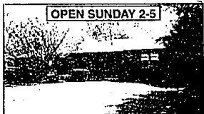
CONDO ALTERNATIVE or empty nesters. Over an acre estate lot backing to lovely Tam O Shanter Country Club. Doorwalks invites you to enjoy outdoor living. 5441 Doherty, N. of Walnut Lake, E. of Orchard Lake. $164,900 (641-8500) 637636