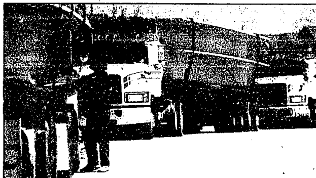
In the beginning: An early frost can be seen as cranes and crews begin building Somerset "North." At the time the opening target was the fall of 1996. That date was rescheduled to Aug. 16. Above, trucks arrive at the site with concrete beams for the mall parking structure. There are 7,000 parking spaces in outside parking areas and inside the covered parking structure.