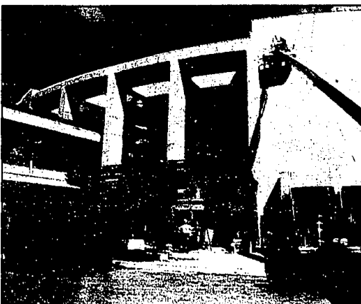
Days to go: Workers go at a feverish pace as opening day draws close. This photo of the front of the new mall was taken last week.