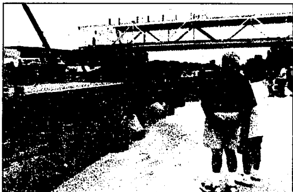
Better than TV: Hanging a skywalk 700 feet across Big Beaver, also under construction, drew an audience during a July heat wave last summer.