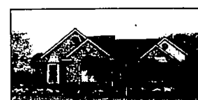
LAKE SHERWOOD CONTEMPORARY. First floor master with master bath/whirlpool. Marble entry, sun room, kitchen with center island, walk-in pantry. Finished lower level with full bath, wet bar, fireplace. $590,000 (ED-H-25WIT) 640697 Call 646-1400