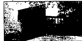
LOWER LONG LAKE AREA. Contemporary on wooded lot with brick decked lap pool. Master bath with Jacuzzi, library/bedroom with attached full bath. Privacy. $599,000 (ED-H-47BLG) 627524 Call 646-1400