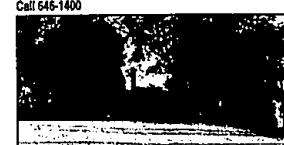
BEAUTIFUL ESTATE RANCH. Charm of the 20's, conveniences of the 90's. Fireplaces in living room and master suite. High ceilings, crown moldings and French doors. $489,000 (ED-H-27BRO) 634543 Call 646-1400