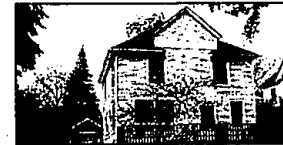
IN-TOWN BIRMINGHAM. Great walk to town location in an area of more expensive homes. Close to parks and theater and shops. 3 bedrooms, 1.5 baths. $239,900 (ED-B-35FRA) 629085 Call 644-6700