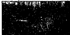
SCENIC, SECLUDED BUILDING SITE. 2.22 ACRES. Paint Creek on the west and north; Paint Creek Nature Trail on the east boundary. Trout fishing. Wooded. Area of beautiful home sites. $145,900 (ED-R-00DUT) 623865 Call 656-6500