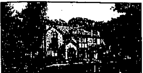
CUSTOM CHESTNUT RUN TUDOR. Four bedrooms, three full 2 1/2 bath. Pool, deck, sunroom and walkout. Security, intercom, wet bar and gourmet kitchen. Luxurious master suite. $798,000 (ED-H-59CHE) 628832 Call 646-1400