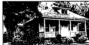
CUTE THREE BEDROOM BUNGALOW offers bright open setting. Central air, walk-out basement, large open back yard. Newer furnace, water heater. New roof. $114,900 (ED-R-06ROM) 629009 Call 656-6500