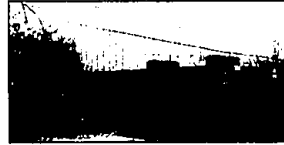
MEDICAL OFFICE CONDO. Centrally located to Beaumont Hospital, Royal Oak and Troy, also St. Joseph's Pontiac. Easy access to I-75. $160,000 (ED-H-98BIR) 625568 Call 646-1400