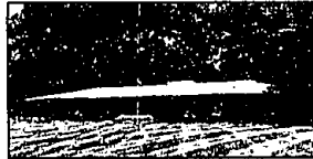
BLOOMFIELD TOWNSHIP RANCH. This tastefully decorated and ready to move in home features a white gourmet kitchen, a fabulous family room, four bedrooms, three beautiful baths on a spectacular lot. $524,900 (ED-B-74DIA) 634472 Call 644-6700