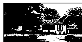
COUNTRY IN THE CITY! Not a drive by. Great starter home. 3/4 acre of property a gardeners paradise. 3 bedrooms, 1 1/2 baths, 3 car garage, huge family room, fireplace in living room. $116,900 (W-45ROU) Call 626-4000