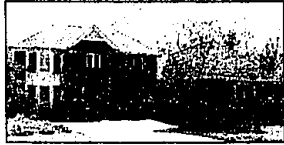
W. BLOOMFIELD LAKEFRONT. This traditional home has so much to offer including hardwood floors, 6 panel doors, bay windows, central air, lake frontage on Darb Lake, walkout basement, much more! $399,900 (ED-W-05BEA)