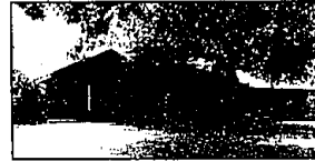
1 ACRE WITH POND! Ranch with quality throughout. 3 bedrooms, master suite, fireplace, 6 panel wood doors throughout. Ceramic flooring in baths, kitchen and laundry/much more! Basement finished with 4th bedroom and bath, 2 1/2 car garage, access to I-96. $166,000 (ED-W-11DEC) Call 626-4000