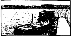
UPPER STRAITS LAKEFRONT-REDUCED BELOW APPRAISED VALUE. Bring all offers. Prime location on the north shore. Almost two acres with hilltop views. 130 ft. of sandy beach. Tiered decking. $689,000 (ED-H-75SUPP) 617632 Call 646-1400