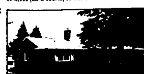
OAKLAND HILLS GOLF COURSE. Recently remodeled and decorated ranch. 2 full baths, living room with fireplace, family room, view of course. New kitchen appliances and carpet. 2 car garage. $234,800 (ED-B-84MAP) 632038 Call 644-6700