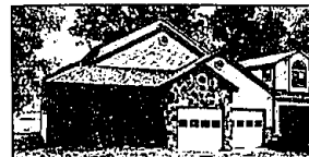
LAKE FRONT! All Sports Lower Straights Lake. 3 bedrooms, 3 baths, white European kitchen, open floor plan. Recessed lighting, skylights, fieldstone fireplace in great room. Bedroom has walk-in closet. Jacuzzi for two and more. $364,500 (ED-W-91TAN) 634532 Call 626-4000