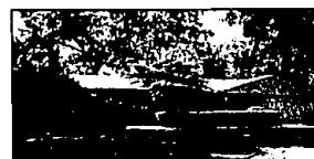
SYLVAN LAKE AT ITS BEST. Impeccable brick ranch on secluded lot. Neutral decor, natural woodwork, brick fireplace, three bedrooms, 1 1/2 baths. Sylvan Lake privileges. $149,900 (ED-H-55CHE) 638313 Call 646-1400