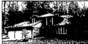
SOFT CONTEMPORARY. Homestead Shores. Includes natural oak trim and floors, 18' ceilings, 2 fireplaces, central vacuum, central air, gourmet kitchen with island, family room, library, lavish master with Jacuzzi, balcony and walk-in closets. Beach and boat privileges across the street. $339,900 (ED-W-74LOC)