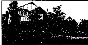
LUXURIOUS BLOOMFIELD CROSSING. This tudor is situated on a tree cul-de-sac: lot 4 large bedrooms, 2 1/2 baths, family room, vaulted ceiling, island kitchen, 3 car garage and exemplary Bloomfield schools and more! $534,800 (ED-B-65TAL) 635642 Call 644-6700