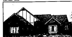
ELEGANT 1 1/2 STORY. Popular N.W. Troy home, open floor plan, 1st floor master suite. 3 additional bedrooms, full basement, great location! $309,800 (ED-B-43ALM) 642442 Call 644-6700