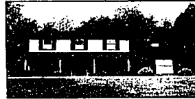
BIRMINGHAM SCHOOLS. Immaculate four bedroom colonial on a private cul-de-sac. Wet plaster, crown moldings, six panel doors and hardwood floors in this fabulous home. One + acre lot. $384,900 (H-61OLD) 633825 Call 646-1400