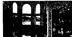
LAKEFRONT CONTEMPORARY - WATKINS LAKE. Over 6000 sq. ft. of living space awaits you in this one-of-a-kind home with spectacular views. Oversized windows, 65'x17' Great Room, numerous amenities make this the ultimate in living, relaxing, entertaining. $1,195,000 (B-ILAK) Call 625-9300