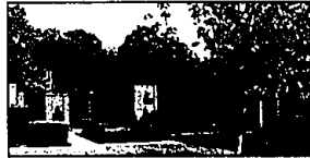
CLOISTERS CONDOMINIUM. Up north wooded setting with Bloomfield schools. Courtyard entry with patio and gas grill. Library with fireplace, lower level walk-out. Pool and clubhouse. $164,000 (ED-H-79BOR) 503685 Call 646-1400