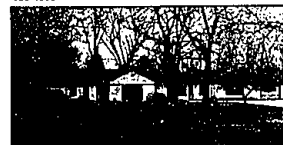
FANTASTIC LOT-MATURE TREES! Beautiful view of woods and ravine from large picture windows. 2 fireplaces, 3 bedrooms, one with sitting room, tub and shower in central bath, updated kitchen. $182,500 (ED-W-70SPR) 623855 Call 626-4000