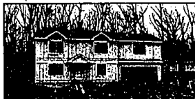
NEW CONSTRUCTION! 2680 sq. ft. colonial. Master suite with walk-in closet and ceramic shower. Second floor laundry. Large kitchen, nook and dining area. Full walkout basement, attached garage. $179,800 608317 (ED-W-420SIL) Call 626-4000