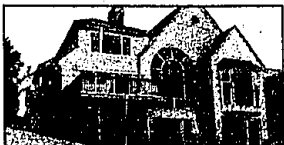
PINE LAKE FRONT ESTATE. 8,000 sq. ft. of luxury. Built and designed by Tobocon in 1993. Open floor plan, 2 story ceilings, in-law quarters, 4 bedrooms, 7 baths, 2 lavatories, 3 full kitchens, 3 laundry rooms, 4 car garage. Loaded with every amenity you could dream of! $2,190,000 (ED-W-26LON)