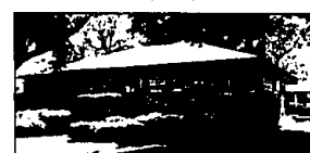
SPACIOUS GREAT BUY on quiet street in Huntington Woods! Over 1,600 sq. ft., 3 bedrooms, 2 1/2 baths, hardwood floors, huge full basement, 2 car garage, large yard. $168,000 (K131E) 647-6400