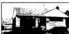
CHEAPER THAN RENT VERY SHARP brick Ranch in wonderful neighborhood in Eastpointe. Womanized deck off kitchen, hardwood floors, newer furnace, and central air. $64,900 (S167E) 647-6400