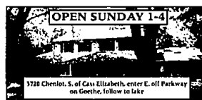
OPEN SUNDAY 1-4 DOUBLE LOT DESIGNED FOR TODAY'S LIVING! Huge great room, cathedral ceilings, skylights, overlooking Cass Lake in Waterford. $209,900 (C372E) 851-4400