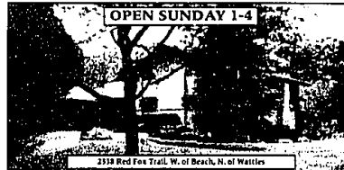
OPEN SUNDAY 1-4 PARK LIKE SETTING ONE-HALF ACRE! Entertainment paradise in Troy with huge family room, fireplace, game-room with pool table, solarium with hot tub, 4 bedrooms, 3 1/2 baths, library, covered veranda, multi-tiered deck and more! $323,750 (RF253E) 641-1660