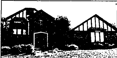
BETTER THAN NEW LOVELY Farmington Hills Tudor offers four bedrooms, three full baths and one half bath, library, formal dining room, family room with fireplace, finished walkout, and a private hot tub. $298,000 (H391E) 851-4400