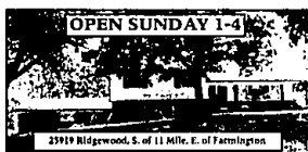
OPEN SUNDAY 1-4 PRIVATE LOCATION LOVELY 3 Bedroom home in Farmington Hills has hardwood floors, cove ceilings, 2 baths, heated inground pool, and beautiful landscaping. $199,900 (R259E) 851-4400