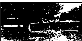
MOVE-IN CONDITION BEST subdivision beach around and just 4 houses from Pine Lake in West Bloomfield. 3 bedrooms, hardwood floors, Pella windows, nice landscaped lot, Bloomfield schools. $244,900 (N387E) 647-6400