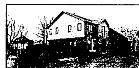
PEACEFUL 2.5 ACRE sub setting in Springfield with pond frontage and woods, yet minutes from freeway access. Gracious newer 3 bedroom brick Colonial with finished walkout. $229,800 (E835E) 641-1660