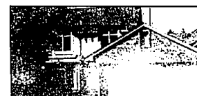
EXCEPTIONAL PRIVACY WONDERFUL Bingham Farms Condo has picturesque view, 2 bedrooms, full, outstanding master with fireplace, full bath, balcony. Immaculate and tastefully maintained. $239,900 (B240E) 647-6400