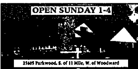
OPEN SUNDAY 1-4 DOUBLE LOT SPACIOUS Rained Ranch in Huntington Woods w/4 bedrooms, gourmet kitchen, family room w/fireplace, attached garage with breezeway. Newer in '96: windows, furnace, central air, roof. $244,900 (P256E) 547-2000