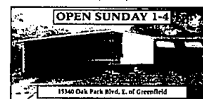
OPEN SUNDAY 1-4 WHAT A BUY! CONTEMPORARY 3 bedroom home in Oak Park has modern kitchen with new cabinets, formal dining room, central air, finished basement with full bath. $89,000 (D193E) 851-4400