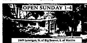
OPEN SUNDAY 1-4 LOVELY WOODED LOT WELL MAINTAINED with much potential! Troy Ranch with three bedrooms, two full baths, and finished basement. $176,000 (L244E) 647-6400