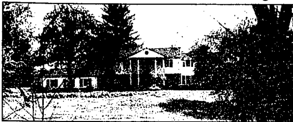
MINI ESTATE! THREE ACRES WITH TREES, STREAM AND TENNIS COURT! Charming 4 bedroom Wing Colonial in Bingham Farms featuring library, large kitchen, formal dining room, 3 car garage, gardens and decks. $699,700 (D329E) 851-4400