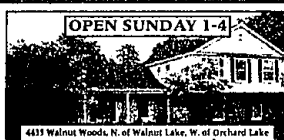
OPEN SUNDAY 1-4 JUST REDUCED LARGE AND BEAUTIFUL LOT comes with this 4 bedroom, 2 1/2 bath home in West Bloomfield with an upstairs laundry and many updates. $238,000 (W443E) 851-4400