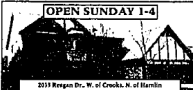
OPEN SUNDAY 1-4 SCENIC AREA SPACIOUS Tudor in Rochester Hills features 4 bedrooms, 2 1/2 baths, family room with wet bar, library, 1st floor laundry, deck, and sprinkler system. $262,900 (R203E) 641-1660