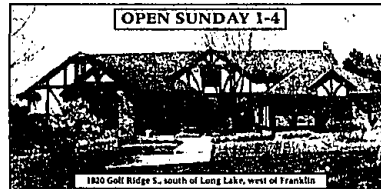
OPEN SUNDAY 1-4 GOLFER'S DREAM ON THE 14TH FAIRWAY! Beautiful home in Bloomfield Hills with views of Haines Lake, 1st floor master suite, gourmet kitchen, and a finished walk-out. $649,000 (G182E) 851-4400