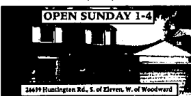
OPEN SUNDAY 1-4 JUST REDUCED! CHARMING home in Huntington Woods with "front of the woods" location. Hardwood floors, finished basement, large screened porch overlooking fabulous yard with custom decking. $199,900 (H266E) 647-6400