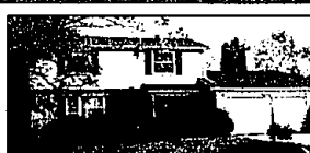
MANY UPDATES CLASSIC Colonial in Troy features family room, full basement, four bedrooms, first floor laundry, newer windows and much more. $214,900 (D367E) 647-6400