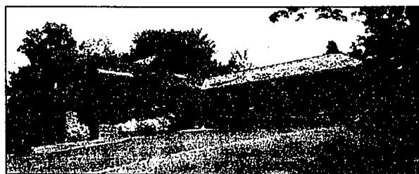
UNIQUE CUSTOM 4 bedroom detached condo home situated in fabulously landscaped area of ponds, water falls and natural preserves. Luxury gated community in Bloomfield Hills. Best buy available. $759,000 (W112E) 641-1660