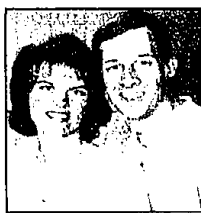
by Ford Motor Co. in Dearborn. An October ceremony is planned.

Her fiancé is a graduate of Troy Athens High School, Michigan State University and Wayne State University. He is employed