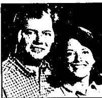
insey and Co. in Chicago. A September wedding is planned.

Her fiancé is a graduate of the University of Illinois and the Massachusetts Institute of Technology. He is employed by McK-