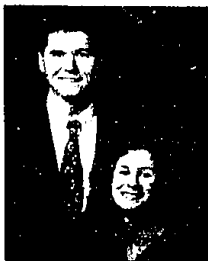
at Lutheran Church of the Redeemer in Birmingham.