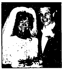
They are making their home in Waterford.

A reception was held at The Village Club. The newlyweds honeymooned in London, England and Edinburgh, Scotland.