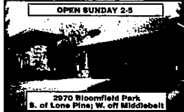
2970 Bloomfield Park

Lower Long Lake, sensational soft contemporary on private estate lot has open floor plan with 26 ft. vaulted ceilings, gourmet kitchen and walkout lower level. $699,900. CALL 800-646-0065, code 2062, for recorded information or pager 810-258-2452 BEVERLY CLEMO