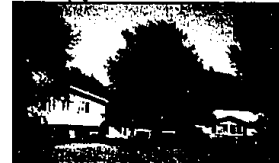
OVER 1/2 ACRE

Three bedrooms, two bath colonial with West Bloomfield Schools. Dock your boat in your back yard. Cul-de-sac location with private beach. Built in 1987. $234,900. CALL KELLIE 646-5000 ext. 227, 485-7886 pager