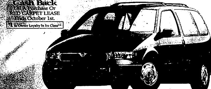
1996 Mercury Villager GS

Hurry $1,500 4 Cash Back On A Purchase Or RED CARPET LEASE Ends October 1 st . *Always Get Owner Loyalty In Its Class**