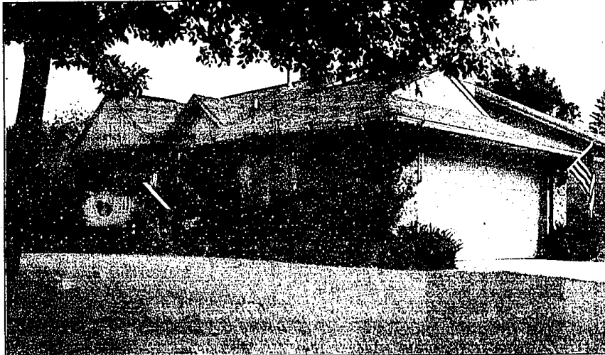
River Pines: This condominium community in Farmington Hills offers a beautiful landscape and plenty of amenities at no extra cost within the units.

"People say a door won't close and it's been 2-1/2 years. I tell Mario, 'Send someone over.'"