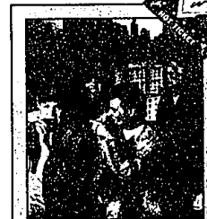
HOT TIP: The Manhattan Transfer performs their four-part vocal harmonies with the Detroit Symphony Orchestra at Orchestra Hall Oct. 10-13. Call (313) 833-3700.

Practice: With magical dexterity, a violinist makes her instrument come alive during a Birmingham-Bloomfield Symphony Orchestra rehearsal.