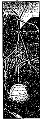
Fabulous fall activities await at Greenfield Village in Dearborn. Visit the Martinsville Cider Mill to learn the history of cider-making, (313) 271-1976.