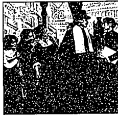
Youtheatre presents an all-new musical adaption of the classic story "Phantom of the Opera," at Music Hall Center, (313) 963-2366.