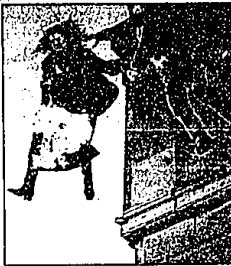
Geena Davis (Samantha Caine) and Samuel L. Jackson (Mitch Hennessey) star in New Line Cinema's action-thriller, "The Long Kiss Goodnight," opening tonight at metro Detroit movie theaters.