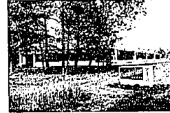
West Bloomfield - Orchard Lake Rd. (1/4 Mile North of 14 Mile)