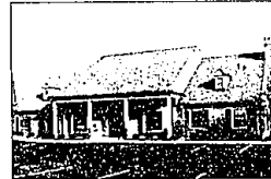
Troy - Long Lake Rd. (1/4 Mile West of Crooks)