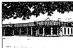
Birmingham - S. Hunter Blvd. (Just North of 14 1/2 Mile)

The Sign Of Success Throughout The Suburbs!