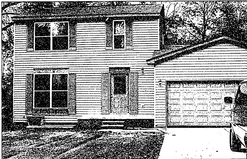
Meadow Downs: Builders at Meadow Downs can come up with a plan to suite any taste. But simple, functional designs like this are expected to be especially attractive.