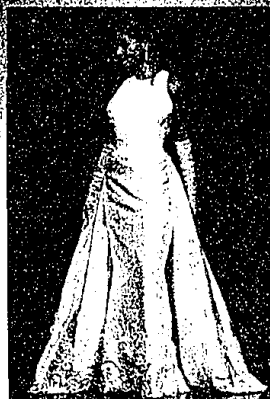
Bridal Designer "REEM AGRA" Trunk Showing Friday & Saturday November 8 & 9 By Appointment

Aetna Build For Retirement, Manage For Life