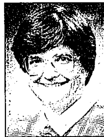
Sister Helen Prejean

Sarandon is on location out of the country making a film and will not be present to receive her award.