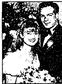
making their home in Beachwood, Ohio.

A reception was held at Morel's. The newlyweds honeymooned in Hawaii, and they are