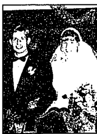
making their home in Farmington Hills.

A reception was held at Plum Hollow Country Club in Southfield. The newlyweds honeymooned in Hawaii, and they are