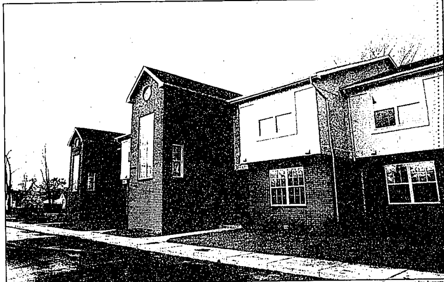
Summer Garden: A combination of brick and copolymer stucco gives this small condominium project in Livonia a unique exterior appearance.

"They were surprised everything was standard, the quality