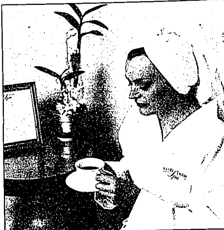
Spa break: In between treatments, this Estee Lauder client relaxes in the "lunchroom" where meals are served from Hudson's Marketplace.

Spa visitors can "positively affect their moods" with an aromatherapy treatment. After filling out a personal profile, a custom blend of oils from herbs and flowers is created for the client and administered in a sound-proof, private room with soothing lighting. From $65.