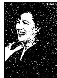
All smiles: 17th Circuit Court Judge Nanci Grant

"The most important person (in the courtroom) is the person before the bench," Nanci Grant continued, "not the one behind it."