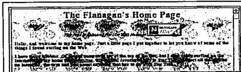
Building a page: The page above comes from the text and HTML mark up commands below.

Emory Daniels may be reached via E-mail at emory@oconline.com. Past columns are archived online at http://oconline.com/~emory/archiv.html.