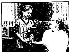
* Month to month rental

Royal Oak 1900 N. Washington Ave. Royal Oak, MI 48073 (810) 685-1999