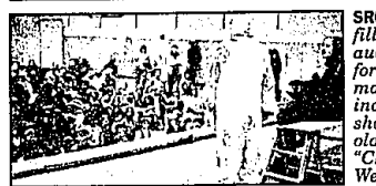
SRO: Children filled the auditorium for all performances, including this showing of the old favorite "Charlotte's Web."