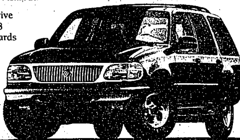
1997 Mercury Mountaineer

See Your Metro Detroit Lincoln-Mercury Dealer Now.