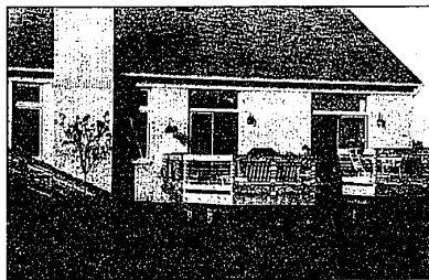
Window treatment: Window tinting can fit any size window of a residence or business.