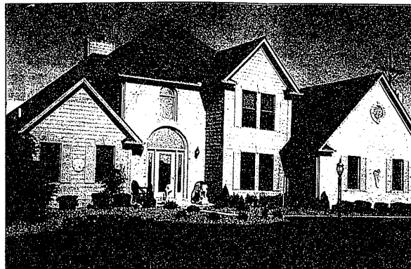
Glass act: Window tinting is a way to save energy and eliminate glare from the sun, and it provides privacy while not blocking the outdoor view. Eclipse Window Tinting Inc. of Redford will exhibit at the Spring Home and Garden Show in Novi this weekend.