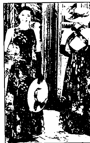
Blooming bridesmaids: Softly flowing print organza from Alfred Angelo, available at area bridal salons in rose, yellow or navy.

And only for very informal weddings can you get away with wearing a dark business suit. In spring or summer, a white dinner jacket may be worn over dark trousers or a navy blazer with white flannel trousers - that's only for the most informal wedding.