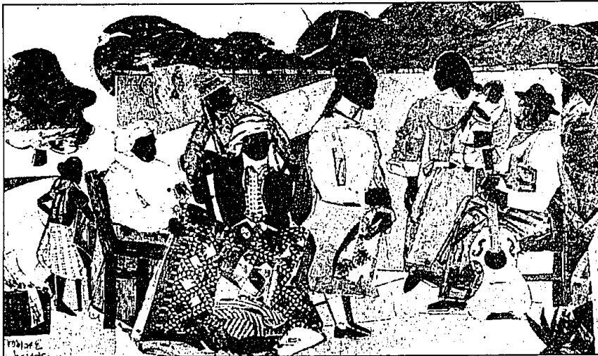
Video Presentation: Narrator Wynton Marsalis demonstrates parallels between Bearden's art and jazz exploring Bearden's creative genius, his philosophy of art, and unique use of the collage medium in the video "Romare Bearden: Visualize Jazz," to be presented 2 p.m. Sunday, Feb. 2 and Saturday, Feb. 22 in the Lecture hall at the Detroit Institute of Arts.

A lecture, "Starting Over," will take place 7 p.m. Thursday, Feb. 13, in Lecture Hall. Charles Gwathmey of Gwathmey Pegel and Associates will discuss contemporary architecture.