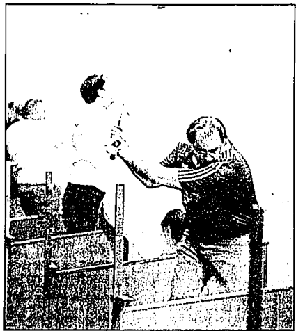
Fore! The air-inflated dome at Oakland Yard Athletics in Waterford is popular with golfers preparing for the upcoming season.

OTHERS: Arbor Dome Indoor Driving Range, 3727 E. Morgan Road, Pittsfield Township, (810) 434-3663.