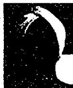
Capelli Facial & Aroma Wrap

Everyone has the potential for perfect balance. A state of well-being that radiates from the inside out. A total contentment of body and spirit. At Capelli, we'll help you discover your balance. Just as winter turns into spring, Capelli will rejuvenate, reinvigorate and renew your very being. For your hair, face and body — for women and for men — Capelli restores the balance and brings you to a place of total wellness.