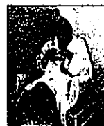
Beluxe Spa Pedicure

The European tradition of "taking the waters" is a centuries old ritual of rejuvenation. The Capelli mineral baths selection include milk-whey, seaweed, fango-mud, aromatherapy and assorted mineral salts. We recommend following the mineral bath with an hour-long massage, designed to complement this beneficial treatment and further relax the muscles.