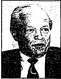
U.S. Rep. Joe Knollenberg