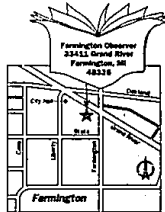
TAMMIE GRAVES / STAFF ARTIST