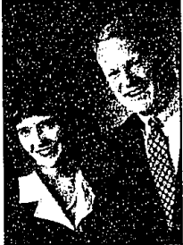
planned at the Chapel of Our Lady of Orchard Lake.