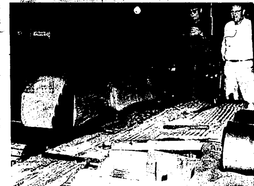
SPLIT — Ken Bassett watches as the saw bites into a log.