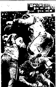
and a Rose Bowl game. (Left) Teammates open a hole for the brilliant halfback as he drives for the goal line. (Center) The Gophers hoisted him high in the air in an attempt to check the plunge