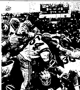
(Right) But the momentum pulls him into the end zone for the six points. Michigan won, 33-20.