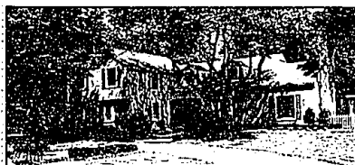
MOVE RIGHT IN

BLOOMFIELD HILLS. Everything has been updated and restored in this lovely New England Colonial. Four bedrooms, 3 1/2 baths, designer kitchen, hardwood thru-out, first floor master, 3 car garage. Magnificent landscaping. $924,900 (OE8756A[R]) 248-642-2400 • 26293