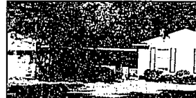
ENJOY THE VIEW

OAK PARK. 3 bedrooms, dining "L", kitchen w/eating space, 13x12 Florida room. Full basement w/tilled floor, gas forced air furnace, central air, 1 car garage. Immediate occupancy. Home is a dryer. $32,500 (OEWO41NOR) 248-645-5800 • 31313