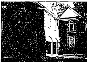
FABULOUS NEW CONSTRUCTION

BIRMINGHAM. Walk to downtown from this very special home. Quality at every turn. Four bedrooms, three and one half baths. No expense spared. See & enjoy! $599,900 (OE17VIN) 248-642-2400 • 26103