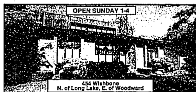
OPEN SUNDAY 1-4

TROY. Loaded with over $50,000 in upgrades. 2 story foyer, family room w/bridge & pillars, 3 full & 2 half baths, 20' deep lot, 3 car garage, 3,700 sq. ft. of pure luxury. A dream home! $399,990 (OE734JA[S]) 248-879-3400 • 23463