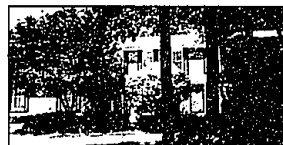
GROSSE PINES COLONIAL

FERNDALE. Many updates in this Ferndale home. Newer vinyl windows, furnace & central air, copper plumbing, circuit breakers. Remodeled bath w/in-cast tub. Kitchen appliances stay. Basement & 1 1/2 car garage. $79,900 (OEWD59CAM) 248-645-5800 • 37783