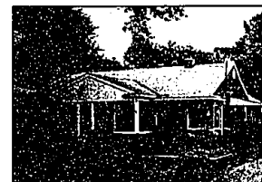
QUIET & SERENE

ROCHESTER. This 4 bedroom home has been freshly painted inside. This colonial had a remodeled kitchen with new brass hardware, a finished rec room with daylight windows, a den, first floor laundry, plus storage & closet space. $239,900 248-642-2400 • 25273