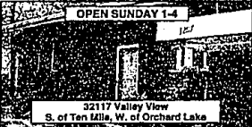
PRIVACY & SECLUSION

TROY. 5 bedroom Cape Cod. Freshly painted interior, newer items: carpet, surfaced driveway, hot water heater, painted exterior, 1st floor laundry, 2 car garage. $150,900 (OE770ELIT) 248-679-3400 • 23323