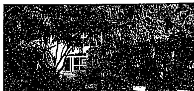
SOPHISTICATED BLOOMFIELD CONTEMPORARY

WEST BLOOMFIELD. Buy now and enjoy the summer activities at this brick quad-level with boat dockage on all sports Pine Lake. New roof in '96 and new interior in neutral tones in 1997. $349,000 (OE8H23B[R]) 248-646-1800 • 26343