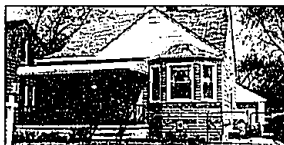
BRICK FRONT BUNGALOW

CLAWSON. Very clean 3 bedroom Ranch with newer windows, newer roof, large finished basement, large eat-in kitchen. Call now, won't last! $104,900 (OEWO4ADON) 248-645-5800 • 37893