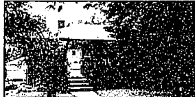
OAK PARK RANCH

FARMINGTON HILLS. If you want a great lot that is close to town, this is what you have been looking for!! Four bedrooms, 1 1/2 baths, fireplace and 2 car garage. Walk to the creek, pick cherries and enjoy the view!! $159,900 248-642-2400 • 26463