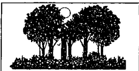
WOODED LOT IN WABEEK

BIRMINGHAM. Walk to downtown from this very special home. Quality at every turn. Four bedrooms, three and one half baths. No expense spared. See & enjoy! $599,900 (OE17VIN) 248-642-2400 • 26103