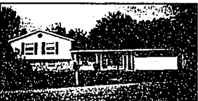
ROOM TO SPARE

TROY. Move in condition. Elegant home features 4 bedrooms, newly remodeled kitchen, hardwood floors, most newer carpet, new siding, newer shingled roof and vinyl windows, security system, 1st floor laundry. Landscaping. $199,900 (OE732BAB) 248-679-3400