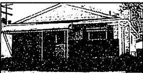
THE PRICE IS RIGHT

TROY. Original owners have maintained this home to perfection! Loaded w/upgrades, oversize 1st floor laundry, 2 1/2 baths, side entry garage, huge deck, sharp & neutral decor. Great location! Troy schools. $215,000 (OE734TAR) 248-679-3400 • 23193