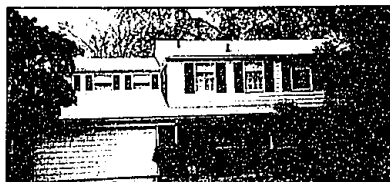
ROOM TO ROAM

BLOOMFIELD HILLS. 3600 sq. ft. on 1.7 acre wooded lot with stream in Bloomfield. Renovated & redecorated thru-out. Loft library, finished walk-out, 2 fireplaces. Multi-level, wide decks & balconies, 3 bedrooms, 2 baths, 2 car attached garage. $599,900 (OEWO0LAH) 248-645-5800 • 31403