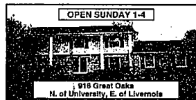
WALK TO DOWNTOWN

FARMINGTON HILLS. Updated country kitchen, newer furnace, central air, hot water tank, roof & windows, garage & fenced yard. Not a drive by. Priced at $66,900. Call Today! 248-737-9000 • 29903