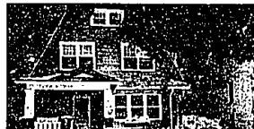
THE PRICE IS RIGHT

INDEPENDENCE TWP. Secluded lot, hardwood floors in foyer/kitchen, cathedral ceilings, sprinkler system, bay windows, beautiful deck, professional landscaping. $229,900 (OE779CRA) 248-679-3400 • 22053