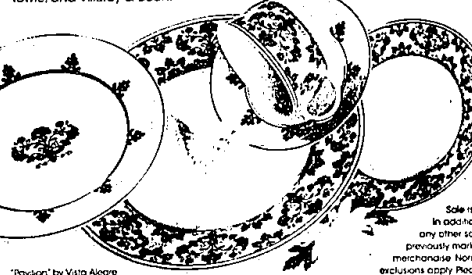
*Pavilion by Vista Alegre

Heslop's brings you the largest selection of in-stock tabletop merchandise in Michigan. Choose from among such famous names as Atlantis, Black, Christian Dior, Cristal J.G. Durand, Dansk, Fitz & Floyd, Gorham, Lenox, Mikasa, Nikko, Noritake, Onoda, Pickard, Reed & Barton, Rosenthal, Royal Doulton, Royal Worcester, Sasaki, Spode, Towle, and Villeroy & Boch.