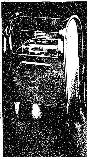
Stamp collector: Missing your college coed already? Tiffany's makes it easy for them to keep in touch with you with this sterling silver mailbox stamp dispenser, $215. It holds up to 100 stamps - with style! Also in the line, a sterling silver ruler, picture frames and key chains. Available at the Somerset Collection South store in Troy.